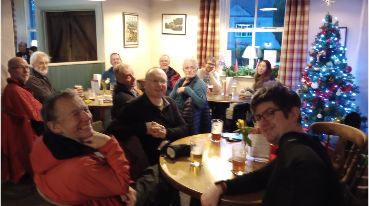
In the Anglers Rest.

south alongside Ladybower savouring the light rainfall. After enjoying bowls of soup in the Ladybower we emerged to somewhat heavier rain as we made our way further south. The party split, some going left up to Cutthroat Bridge and then along Bamford edge whilst the remainder turned right. Our numbers fragmented further at the dam, two continuing along the Derwent Valley Heritage Way to the west of the Derwent and four popping into the Yorkshire Bridge before continuing to Bamford. Most of the team regrouped in the Anglers Rest, warmed up and tried to dry out before the final trek to Thorpe Farm Barns.