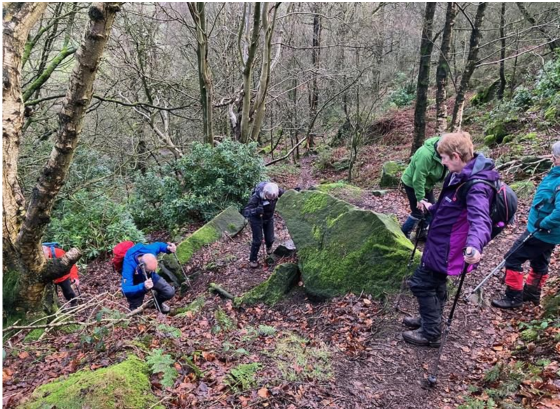
Burning off the puddings near Cocking Tor.

I did my very best to get no participants by giving the wrong start point grid